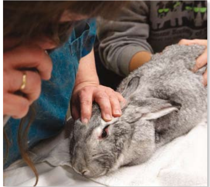
The rabbits arrived at the Humane Society of Missouri for triage and care.