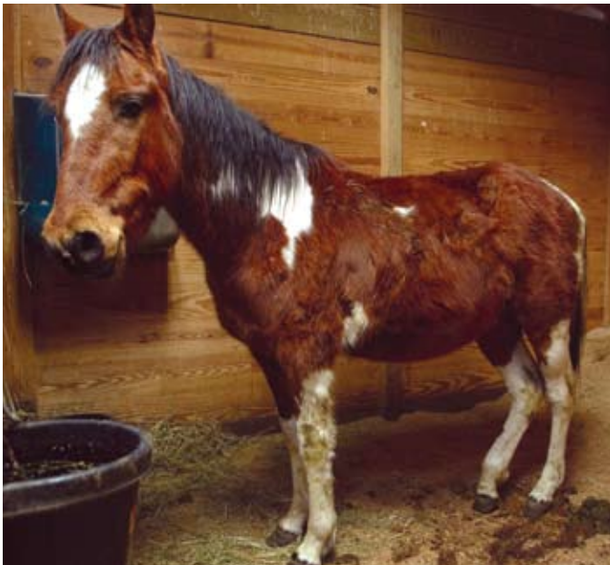
Severely underweight horse now being cared for at Longmeadow.

president of the Humane Society of Missouri. Custody was awarded to the Humane Society in February, but because of their poor condition the animals will not be ready for adoption for a few months. 🐾