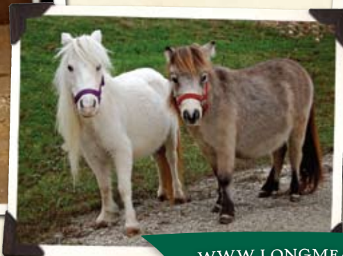
POPPY & SAGE