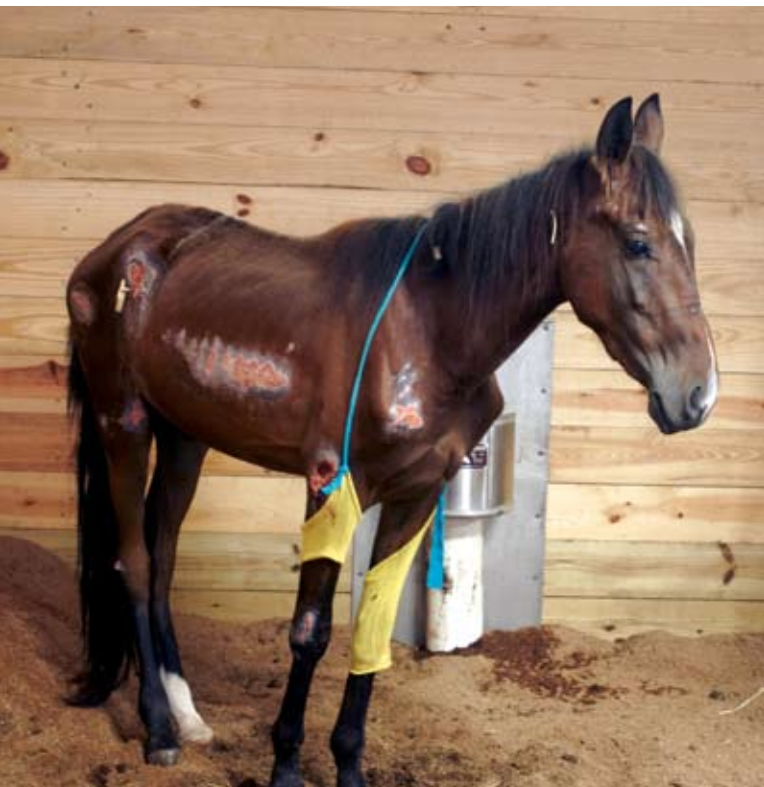
Left: Mason in 2008

“The first two were older than 30 when we adopted them, and they lived another eight years!”