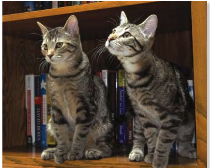
Recommended reading from Mr. Biggs and Wiley: The Cats are in the Rye and The Cats in the Gray Furry Suits .