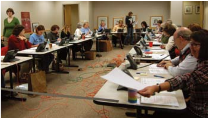
Staff and volunteers answer calls during Humane Society of Missouri's Second Chances Telethon.