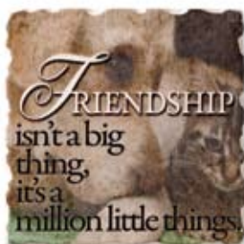
B070128 Single Coaster