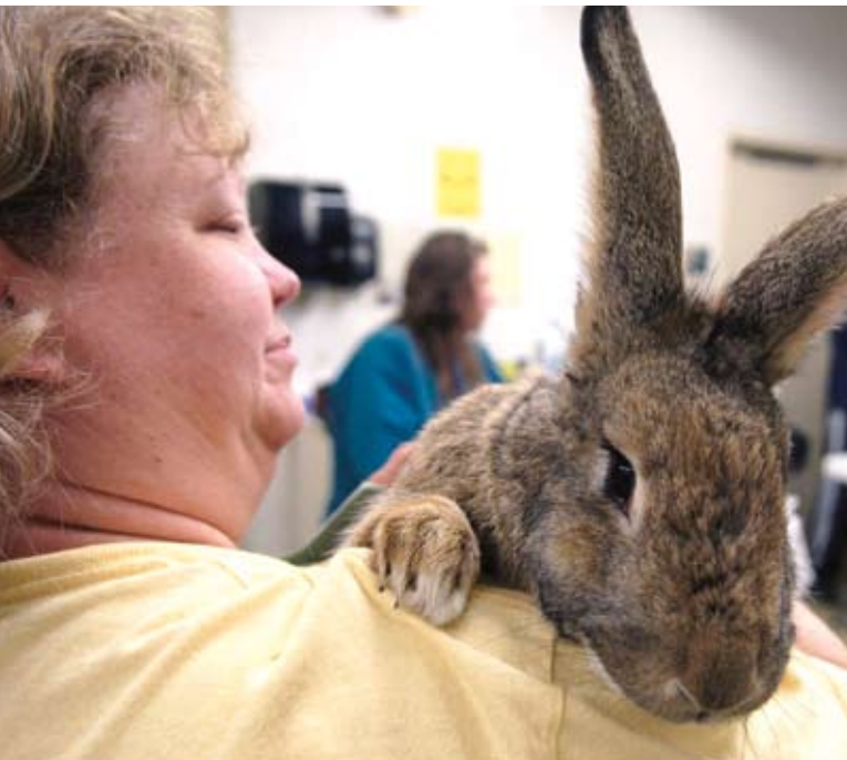
A rescued rabbit safe in the arms of a volunteer from Missouri House Rabbit Society.

Animals living in filthy conditions in freezing weather were rescued in February from a property near St. Clair, Mo. Most were domestic rabbits housed in wire-bottom cages, raised off the ground, with feces piled up high enough to come through the cage bottoms. Many cages had little or no shelter from the snowy, below-freezing weather.