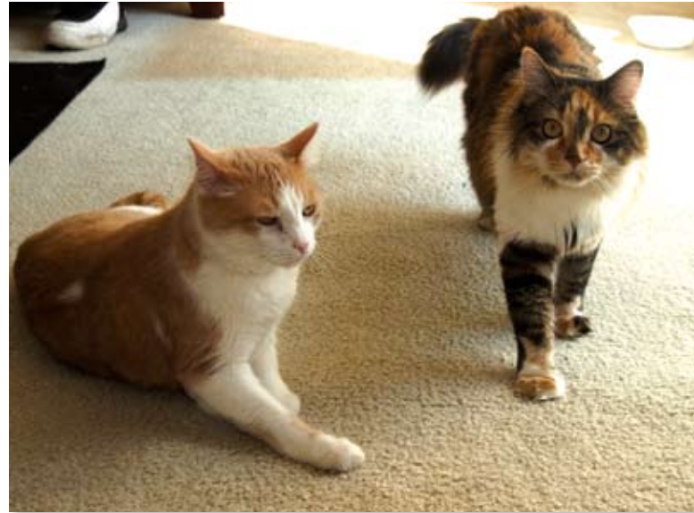
Albert (left) and Addie are good companions to each other and to their adopters.