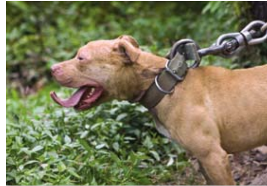
One of the hundreds of dogs rescued by the Humane Society of Missouri in the largest dogfighting raid and rescue in U.S. history.