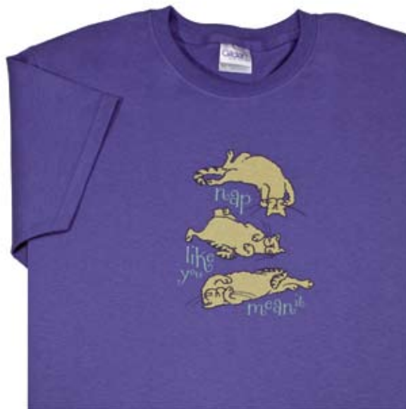
C120016 Nap Like You Mean It!