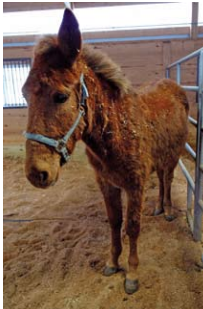
One of the rescued mules.