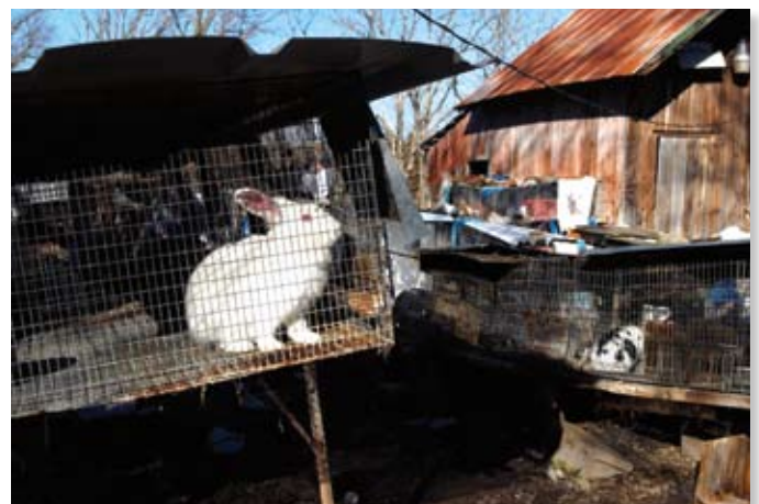
Rabbits living outside with no protection from the elements.

Animals living in filthy conditions in freezing weather were rescued in February from a property near St. Clair, Mo. Most were domestic rabbits housed in wire-bottom cages, raised off the ground, with feces piled up high enough to come through the cage bottoms. Many cages had little or no shelter from the snowy, below-freezing weather.