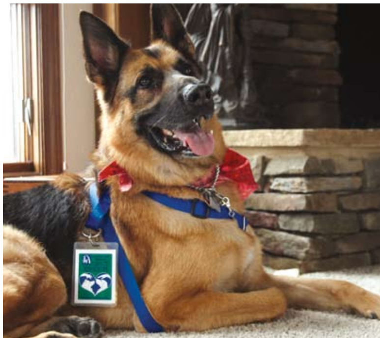
Ralph ready to work as a touch therapy dog.