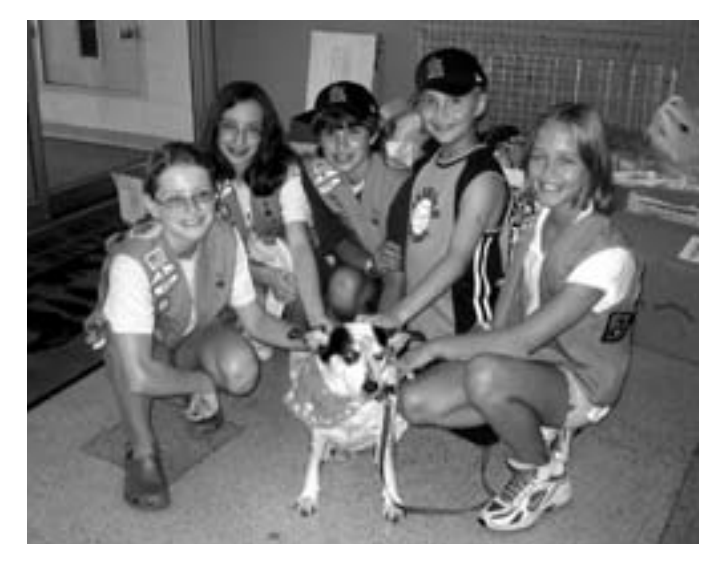
Girl Scouts taking part in a Kind Kids program.

• Get help for the animal!!! Tell a trusted adult and explain to them how the animal is being treated. They can call the Humane Society of Missouri for guidance and help. Examples of animal cruelty include physical abuse, neglect through lack of food, water, shelter and teasing or bullying. Chained dogs are often victims of this treatment.