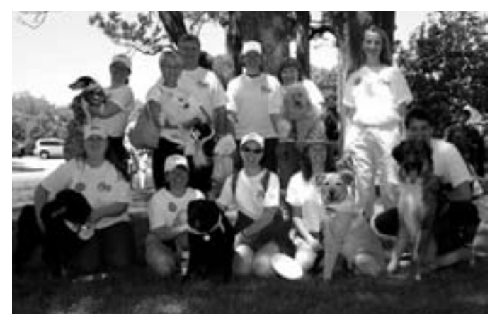
Third Place: Scottrade Barks In The Park