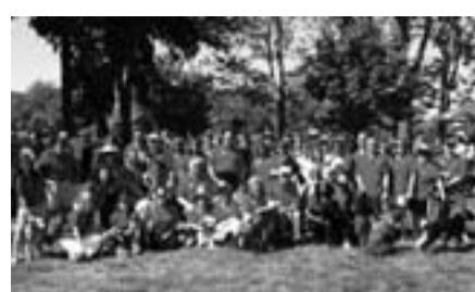
Top Fundraising Individual: Betty Stiern