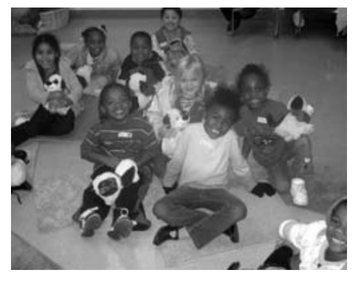
Preschoolers having fun during a Kind Kids program.