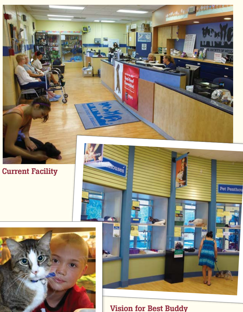
Vision for Best Buddy Pet Center

Future: Ample space for children to participate in age-appropriate humane education classes, for adults to join obedience training sessions and for shelter animals to be socialized and trained.