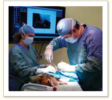
Vision for Best Buddy Pet Center

The current veterinary center is faced with similar constraints. It has space for only three exam rooms and tiny dispensing and recovery areas. The lack of space prevents the addition of updated equipment such as imaging and laser treatment devices. The new Animal