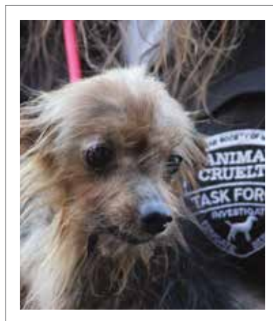
Bitsy at the scene of her rescue. Read her story on the next page.