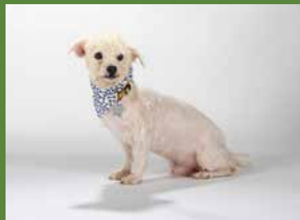
Frank, one of many rescued Bichon Frises, is a lot happier after treatment and grooming.