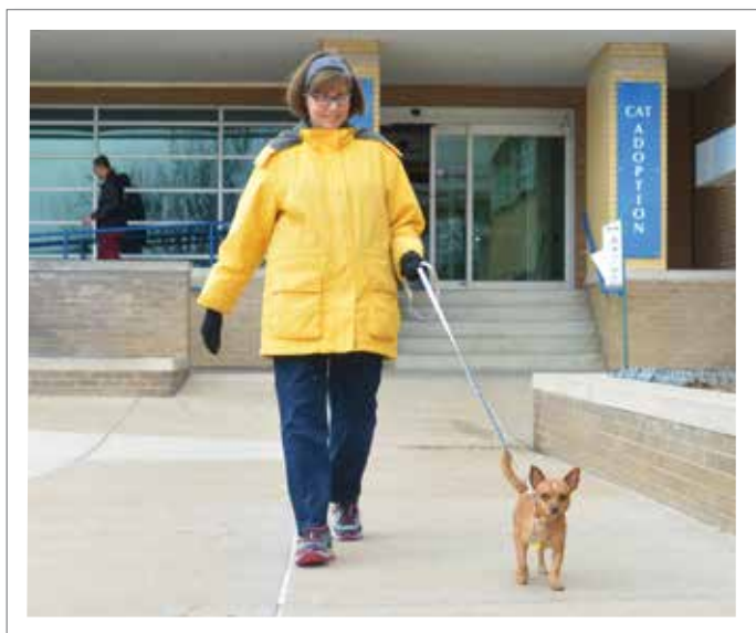
HSMO's volunteer dog walkers give every dog lots of special attention.

Learn more about volunteering as a Pet Pal at www.hsmo.org/volunteer/volunteeradult