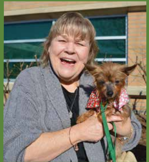
Bitsy on adoption day