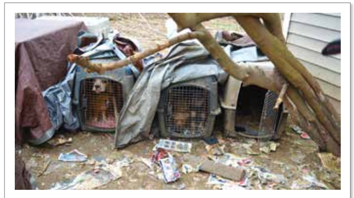
Crates had so many layers of feces- and urine-saturated newspaper, the dogs had little room to stand.