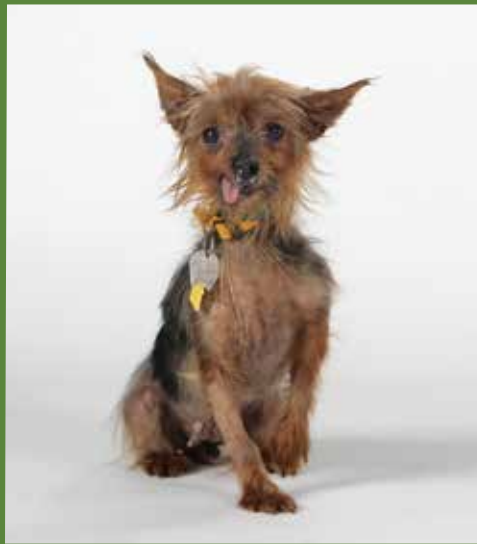
Bitsy after her TLC